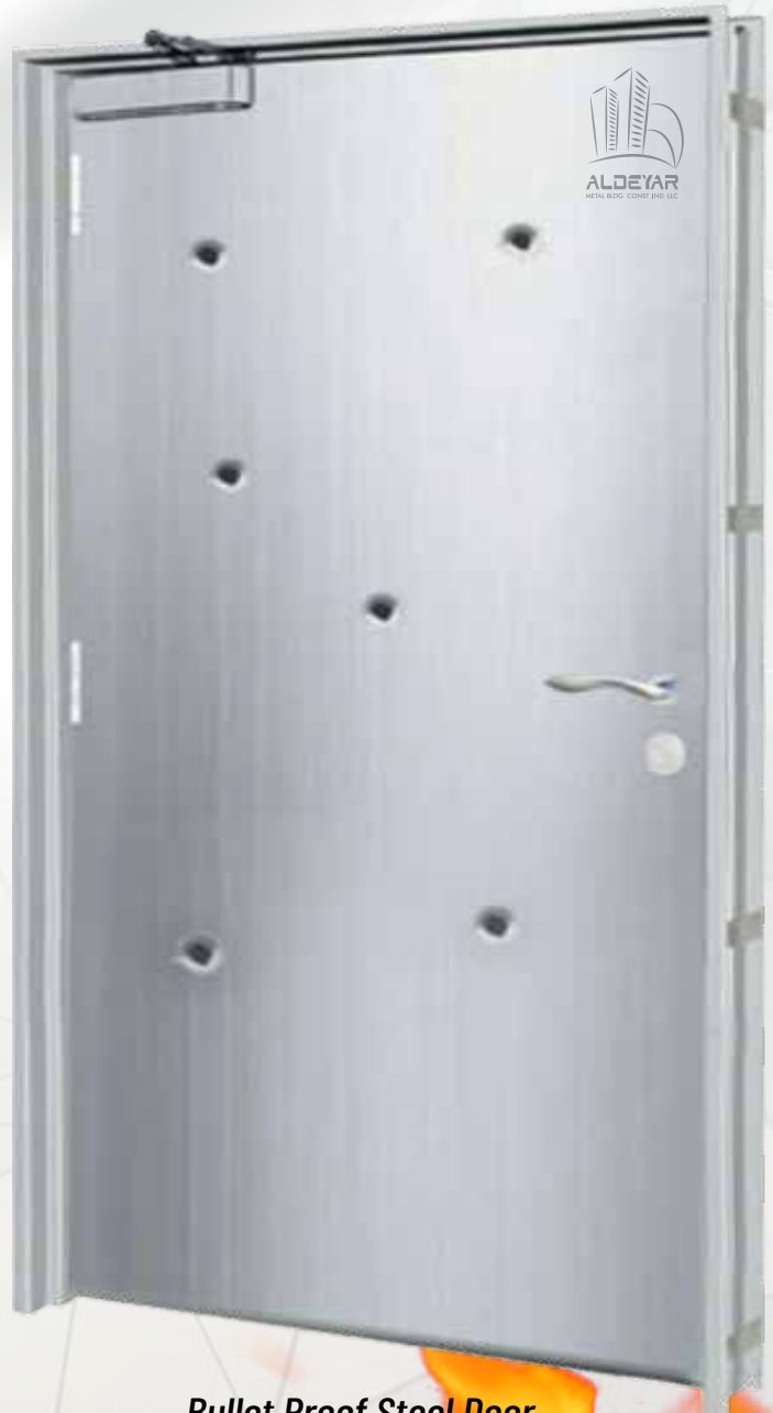
Bullet Proof Steel Door